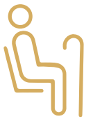
Senior Citizens Sitting Area