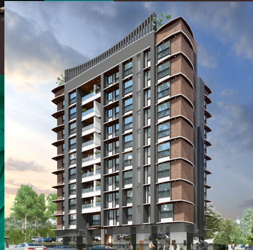
EKAYA 21 st Road, Chembur