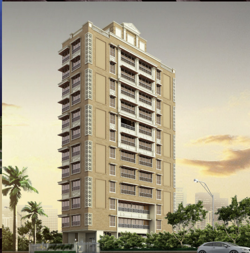
SHRINEKETAN 14 th Road, Chembur