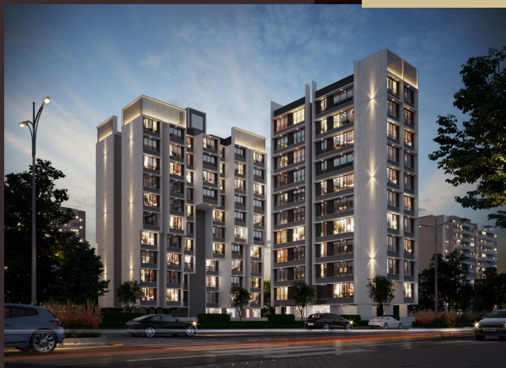
AVIGHNA 14 th Road, Chembur