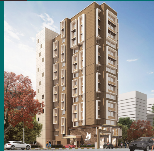
SHANKAR DARSHAN 15 th Road, Chembur