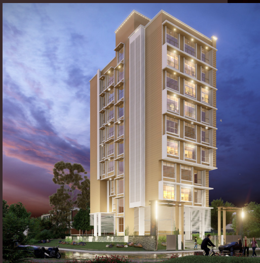
AMARJYOTI 14 th Road, Chembur