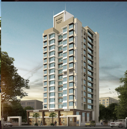
MY DIVINE Aziz Baug, Chembur Naka