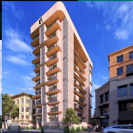
VISHWA BHUVAN 7 th Cross Road, Chembur