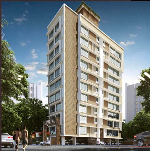
SHREYAS 11 th Road, Chembur