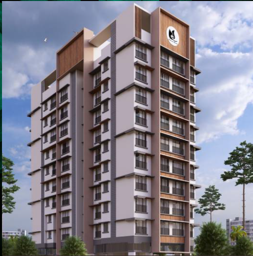
HARI OM Sindhi Society, Chembur