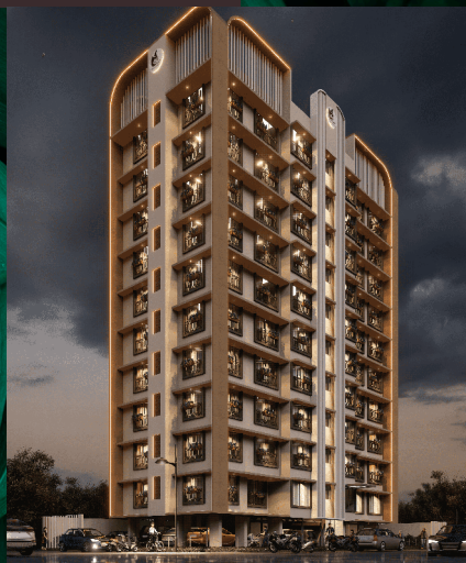
KEDARNATH Shivpuri Road, Chembur