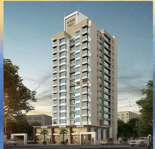
MY DIVINE Aziz Baug, Chembur Naka