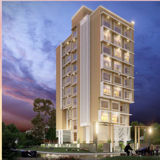
AMARJYOTI 14 th Road, Chembur