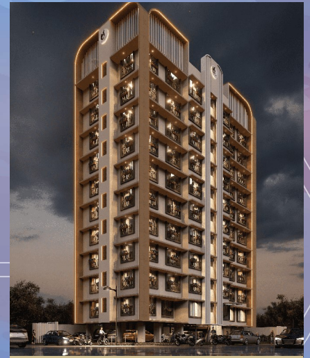
KEDARNATH Shivpuri Road, Chembur