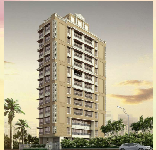
SHRINEKETAN 14 th Road, Chembur