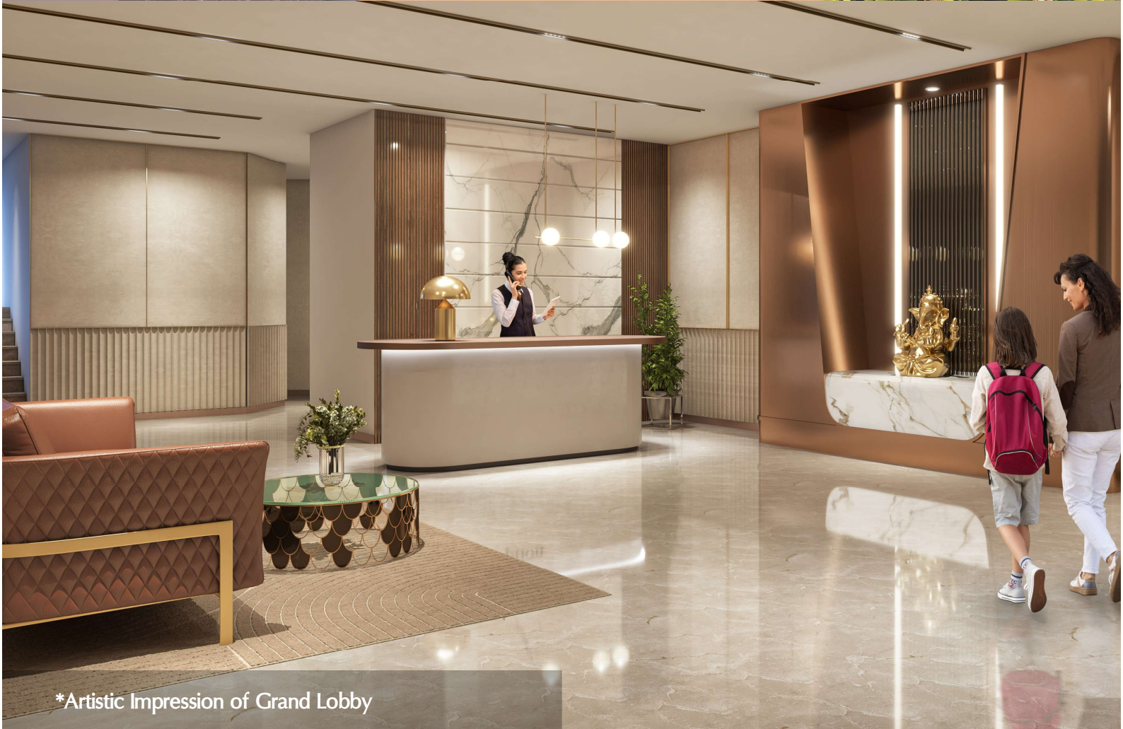
*Artistic Impression of Grand Lobby