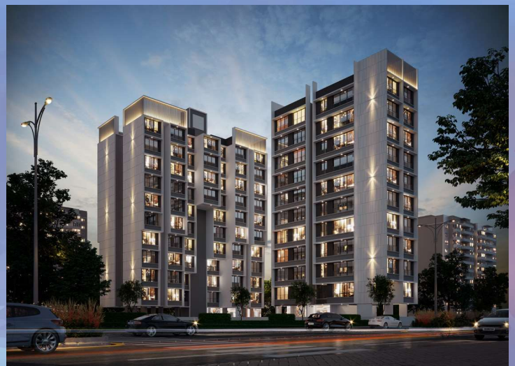
AVIGHNA 14 th Road, Chembur