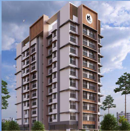
HARI OM Sindhi Society, Chembur