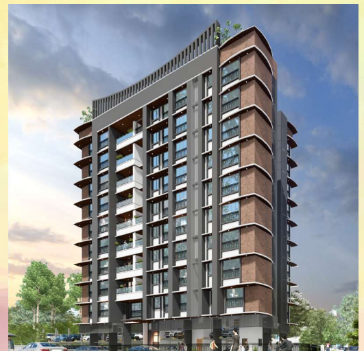
EKAYA 21 st Road, Chembur