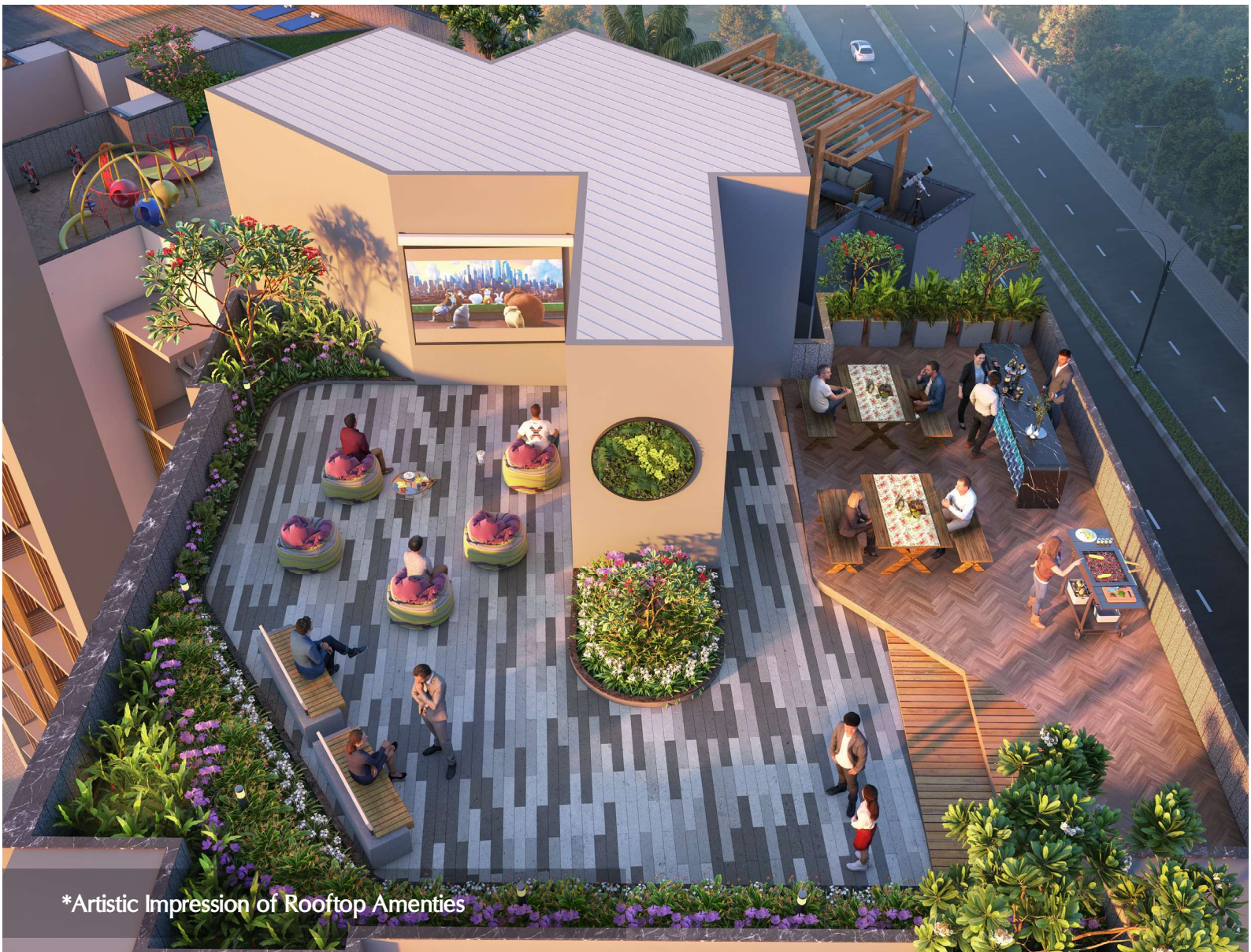
*Artistic Impression of Rooftop Amenities