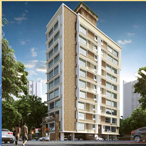
SHREYAS 11 th Road, Chembur