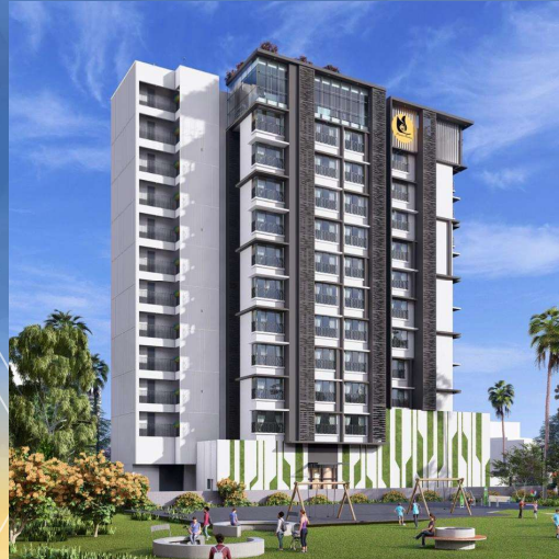
PARK WEST Andheri