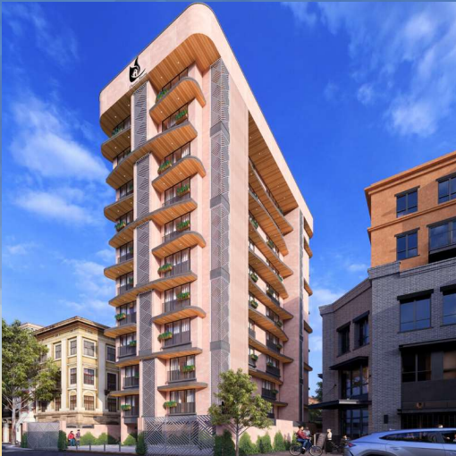
VISHWA BHUVAN 7 th Cross Road, Chembur